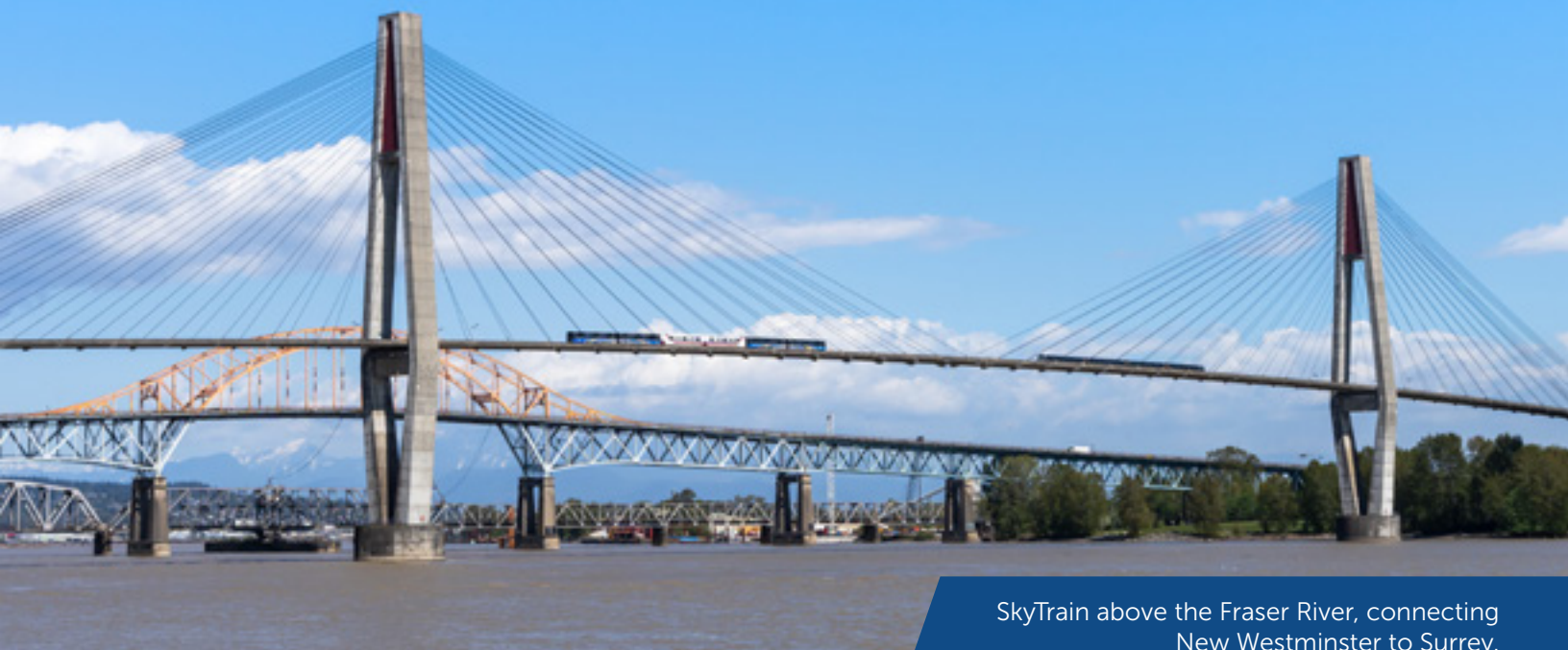
SkyTrain above the Fraser River, connecting New Westminster to Surrey.

RCH is a major regional critical care site providing a range of services, including trauma medicine, orthopedic surgery, cardiac surgery, neurosurgery, plastic surgery, interventional cardiology and thoracic surgery. The hospital also houses outpatient and inpatient mental health services, located in the newly built Mental Health and Substance Use (MHSU) Wellness Centre.