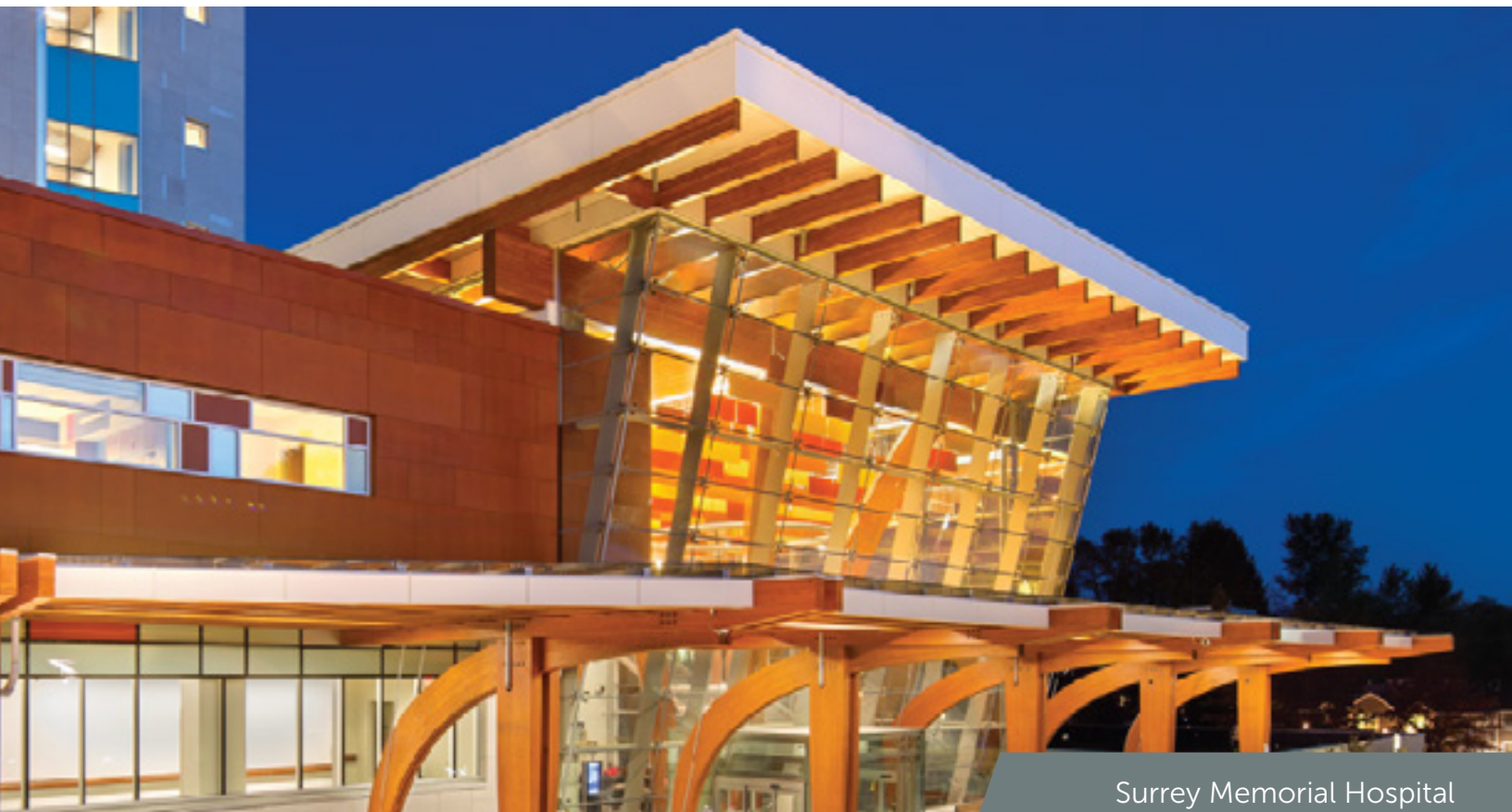
Surrey Memorial Hospital

Learn more about Translink, Metro Vancouver's transportation network.